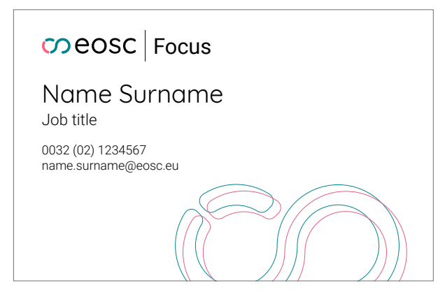
Example of a business card template