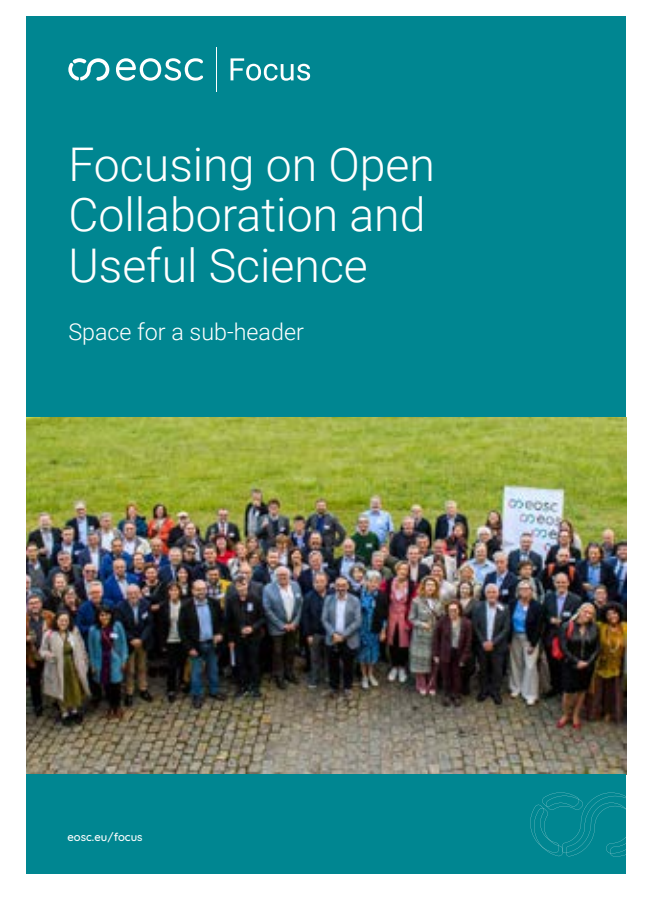
Example of a poster template