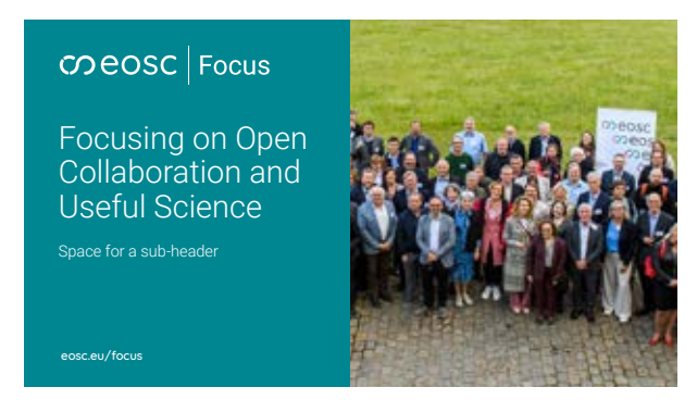
Example of a social media image