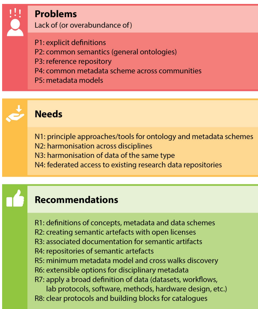
Figure 1: Schematic summary of the Problems, Needs and Recommendations concerning Semantic interoperability (EOSC-IF)

Having set out the wider boundary conditions under which this Task Force operates, it is important to flag out some of the intrinsic uncertainties, complexities, and challenges which accompany this work. Those have been identified in the section ‘Problems and Needs’ (EOSC IF, p. 16ff) 5