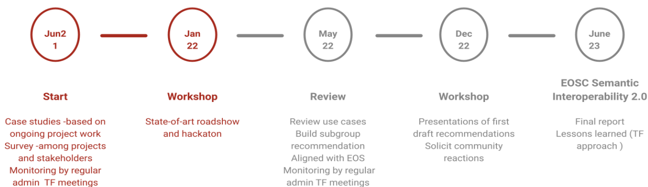
Figure 3: Timeline and stages of the TF